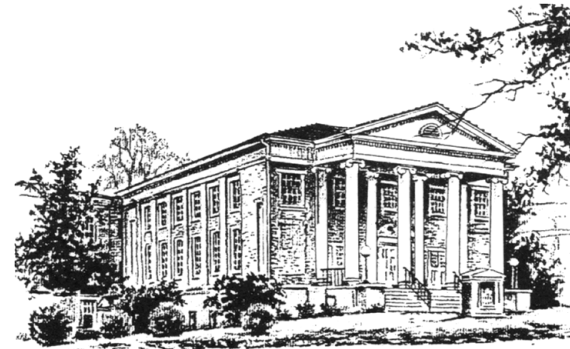
Raleigh Court United Methodist Church Roanoke, VA