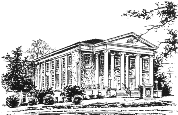
Raleigh Court United Methodist Church Roanoke, VA